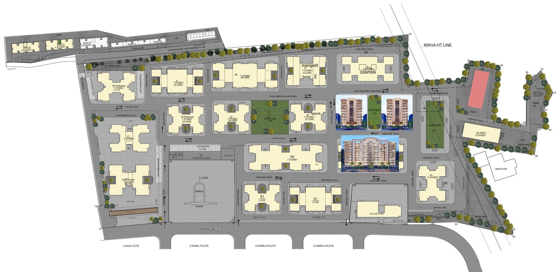
Site Layout Plan